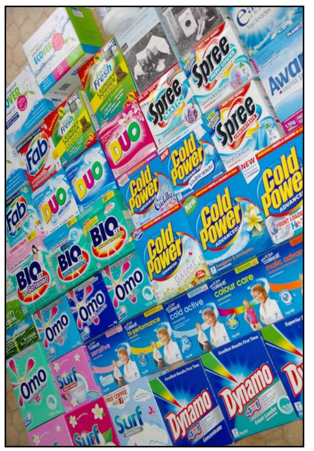
Research Results - 2009