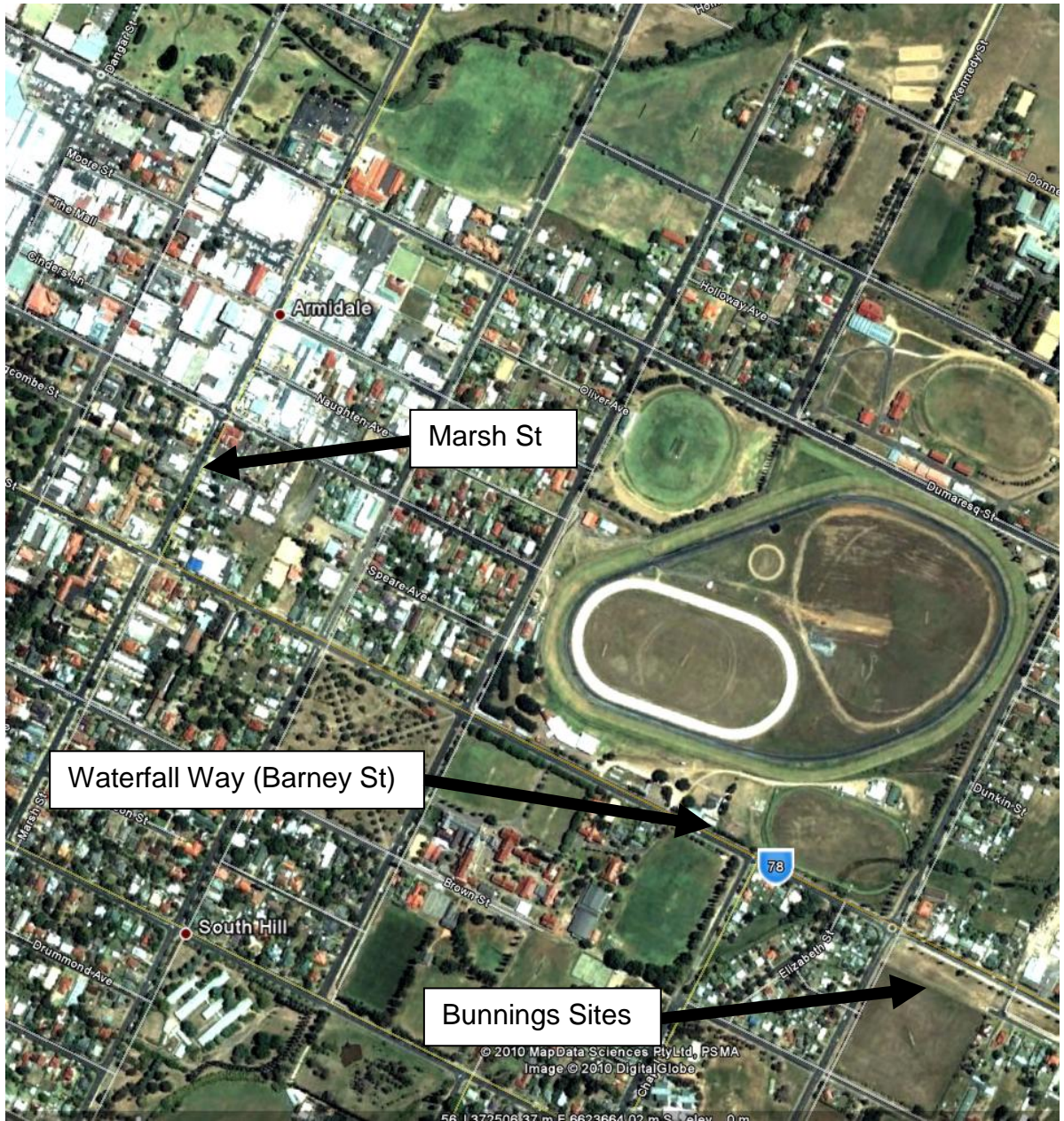
Bunnings Site (Armidale)